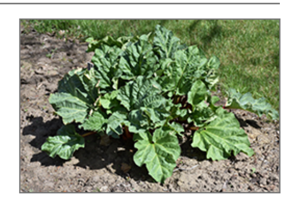
Chipman Red Rhubarb

This is an herbaceous perennial with a rigidly upright and towering form. Its wonderfully bold, coarse texture can be very effective in a balanced garden composition. This plant will require occasional maintenance and upkeep, and can be pruned at anytime. Deer don't particularly care for this plant and will usually leave it alone in favor of tastier treats. It has no significant negative characteristics.