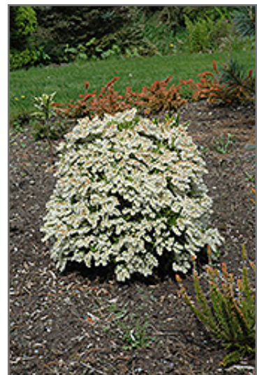
Prelude Japanese Pieris in bloom