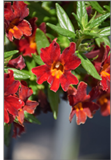
Mai Tai Red Monkeyflower flowers