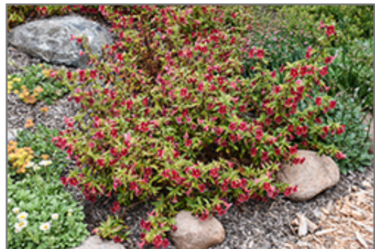
Jelly Bean Dark Pink Monkeyflower in bloom