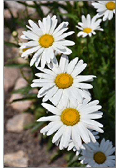
Silver Princess Shasta Daisy flowers