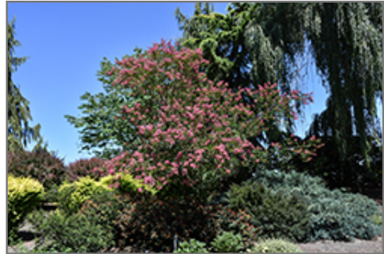
Pecos Crapemyrtle in bloom

Pecos Crapemyrtle is recommended for the following landscape applications;