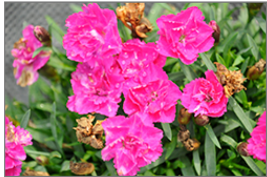
Beauties Melinda Pinks flowers

Beauties Melinda Pinks is recommended for the following landscape applications;