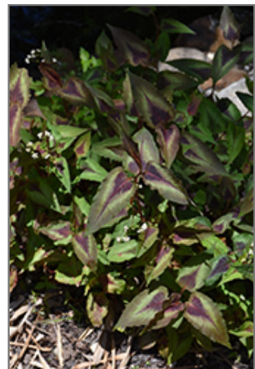
Pink Knotweed foliage