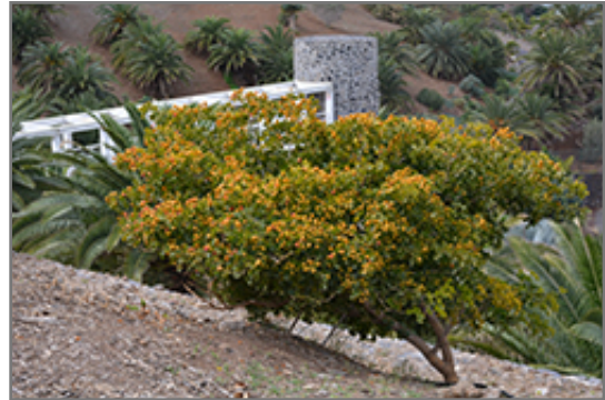
Rough Bark Lignum Vitae fruit

Rough Bark Lignum Vitae is recommended for the following landscape applications;