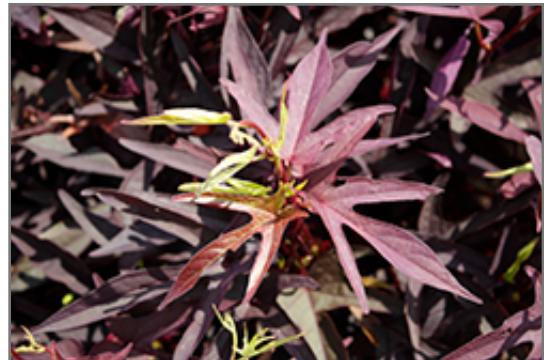
Sweet Caroline Upside Black Coffee Sweet Potato Vine foliage