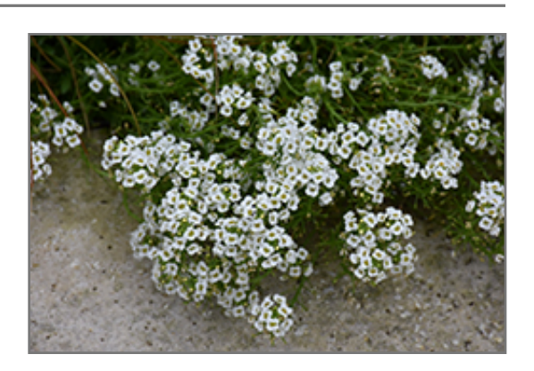
Featherlight White Lobularia flowers

An excellent branching variety guaranteed to turn heads; eye catching, clear white blooms trail from hanging baskets and containers; also great for ground cover and borders; fragrant flowers attract bees and butterflies