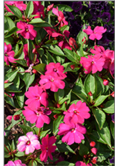
Solarscape Magenta Bliss Impatiens flowers

Solarscape Magenta Bliss Impatiens is recommended for the following landscape applications;