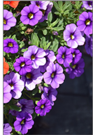
Cha-Cha Lavender Calibrachoa flowers

Cha-Cha Lavender Calibrachoa is recommended for the following landscape applications;