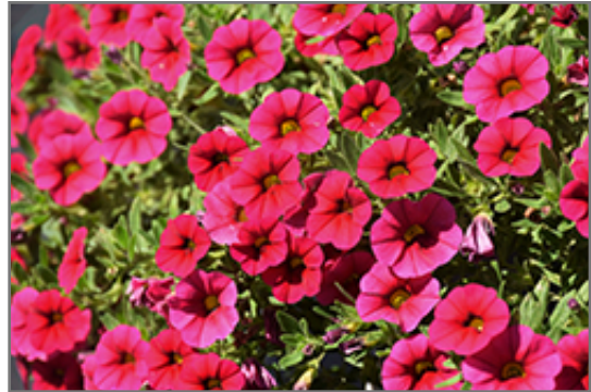
Cabaret Hot Rose Calibrachoa flowers