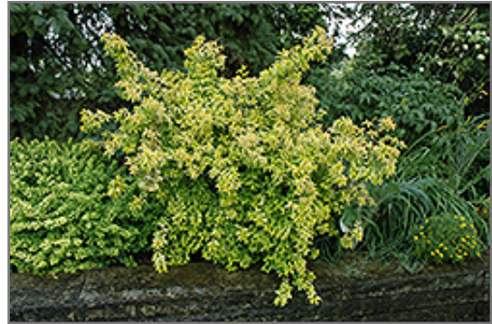
Gold Leaf Forsythia

Gold Leaf Forsythia is recommended for the following landscape applications;