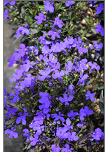
Crystal Palace Lobelia flowers

Crystal Palace Lobelia is recommended for the following landscape applications;