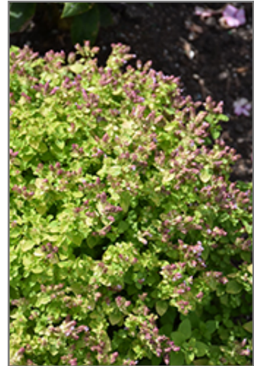
Gilt Trip Oregano flowers