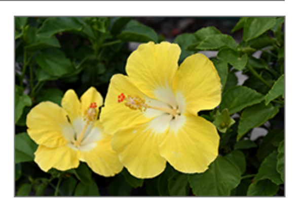
Bonaire Wind Hibiscus flowers