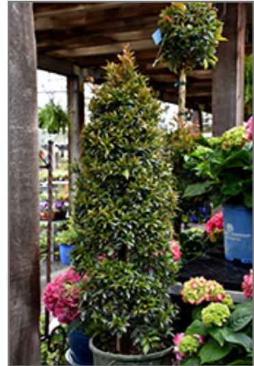
Dwarf Brush Cherry