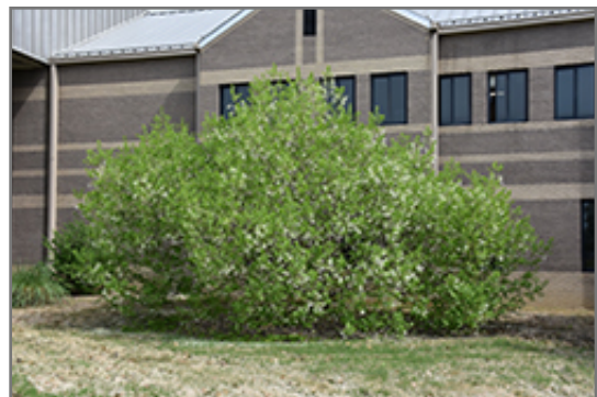
Emerald Knight Fringetree in bloom