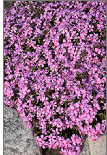
Eye Candy Creeping Phlox in bloom

Eye Candy Creeping Phlox is recommended for the following landscape applications;