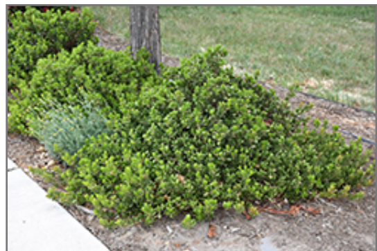
Panchito Manzanita