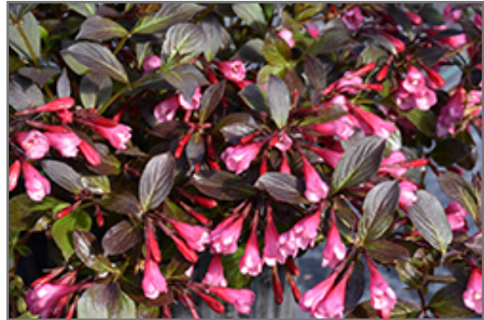
Very Fine Wine Weigela flowers