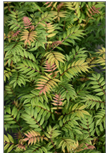
Mr. Mustard False Spirea foliage