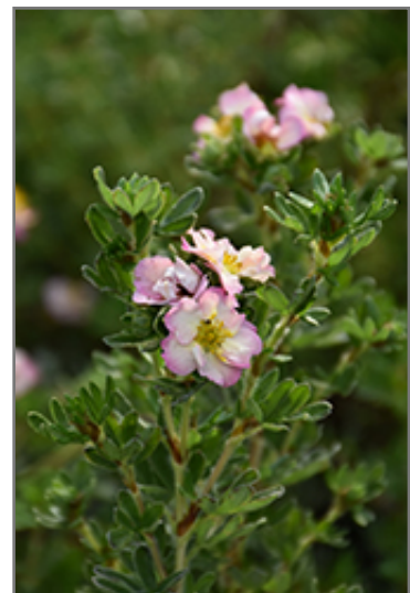
Happy Face Hearts Potentilla flowers