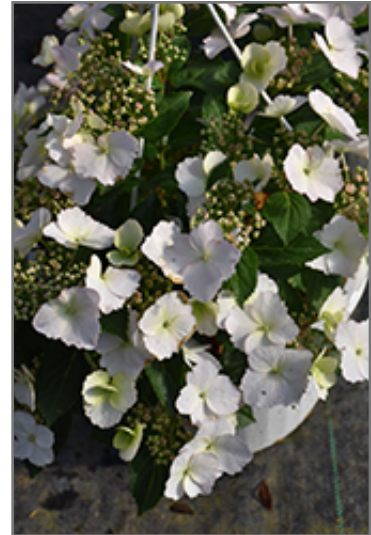
Fairytrail Bride Cascade Hydrangea flowers