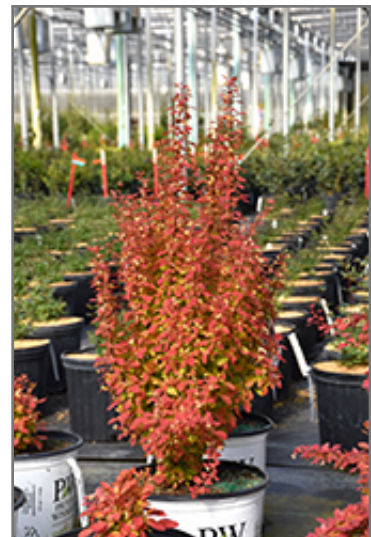
Sunjoy Orange Pillar Japanese Barberry