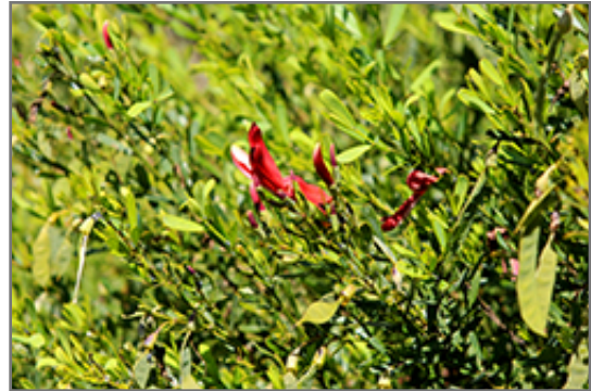
Coral Bush flowers

Coral Bush is recommended for the following landscape applications;