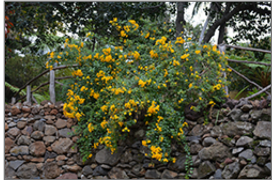
Yellow Marmalade Bush in bloom