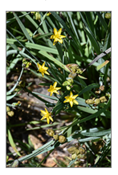
Golden Blue-Eyed Grass flowers