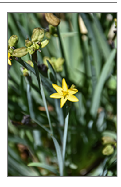
Golden Blue-Eyed Grass flowers