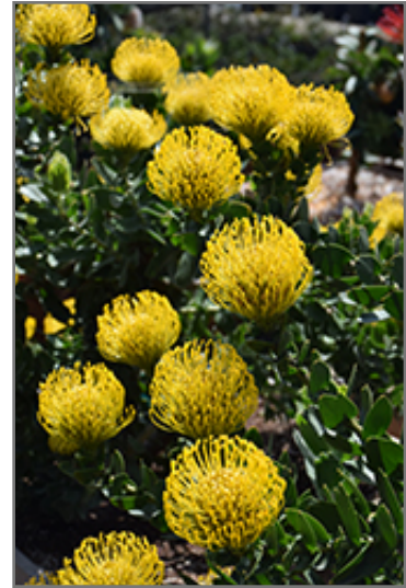
High Gold Pincushion flowers

High Gold Pincushion is recommended for the following landscape applications;