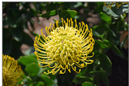
High Gold Pincushion flowers