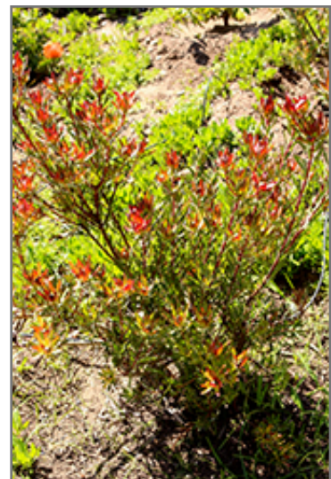
Safari Sunrise Conebush in spring