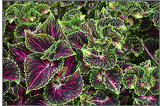
Main Street La Rambla Coleus foliage