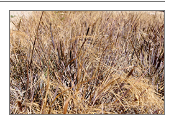
Tallahassee Sunset Elliott's Love Grass foliage

This fine textured, warm season grass forms nice clumps of powder blue foliage that spread outward slowly; produces pale, blue-gray plumes that sway in the wind in summer, turning tan by fall; divide clumps in spring; visually stunning when massed