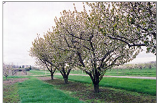
Sweet Cherry in bloom