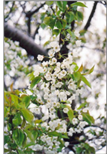
Sweet Cherry flowers

Sweet Cherry is covered in stunning clusters of fragrant white flowers hanging below the branches in early spring before the leaves. It has dark green deciduous foliage. The pointy leaves turn yellow in fall. The fruits are showy red drupes carried in abundance in mid summer. The fruit can be messy if allowed to drop on the lawn or walkways, and may require occasional clean-up. The smooth dark red bark adds an interesting dimension to the landscape.