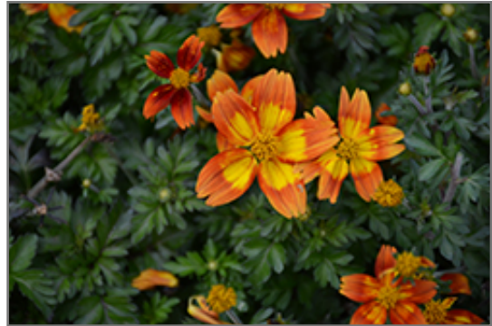
Bidy Bop Blaze Bidens flowers