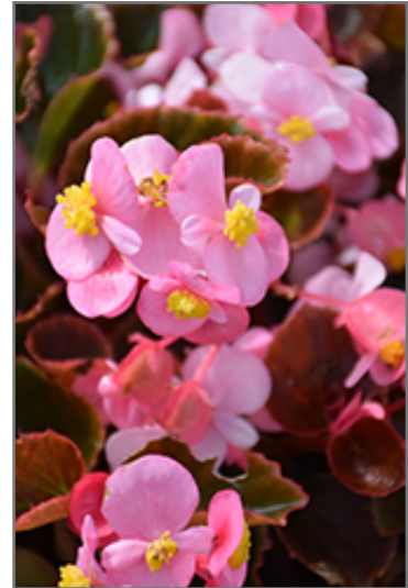
Cocktail Brandy Begonia flowers