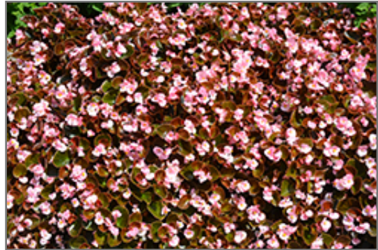
Cocktail Brandy Begonia flowers

Cocktail Brandy Begonia will grow to be about 8 inches tall at maturity, with a spread of 10 inches. When grown in masses or used as a bedding plant, individual plants should be spaced approximately 8 inches apart. Its foliage tends to remain low and dense right to the ground. Although it's not a true annual, this plant can be expected to behave as an annual in our climate if left outdoors over the winter, usually needing replacement the following year. As such, gardeners should take into consideration that it will perform differently than it would in its native habitat.