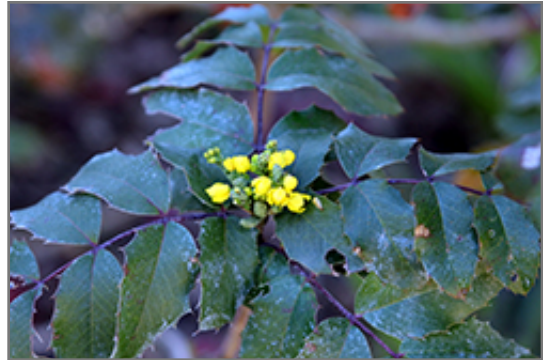
Mission Canyon Barberry flowers