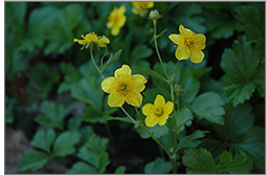
Barren Strawberry flowers