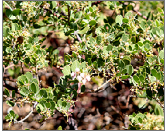
Big Sur Manzanita foliage