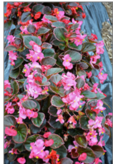
Eureka Bronze Leaf Rose Begonia in bloom