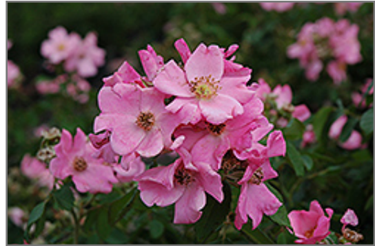
Polar Joy Rose flowers

Polar Joy Rose is recommended for the following landscape applications;