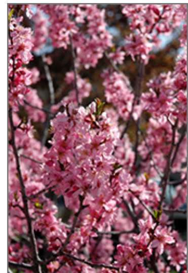
Muckle Plum (tree form) flowers