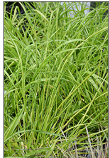
Prairie Winds Lemon Squeeze Fountain Grass foliage