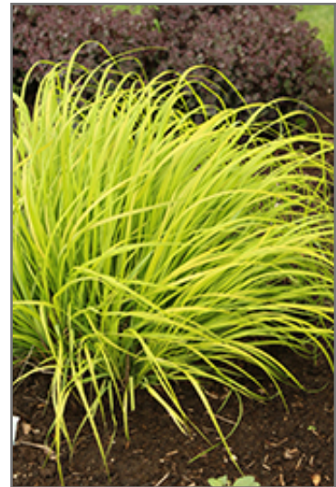
Prairie Winds Lemon Squeeze Fountain Grass

Prairie Winds Lemon Squeeze Fountain Grass is recommended for the following landscape applications;