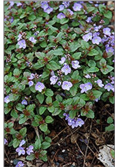
Waterperry Blue Speedwell in bloom