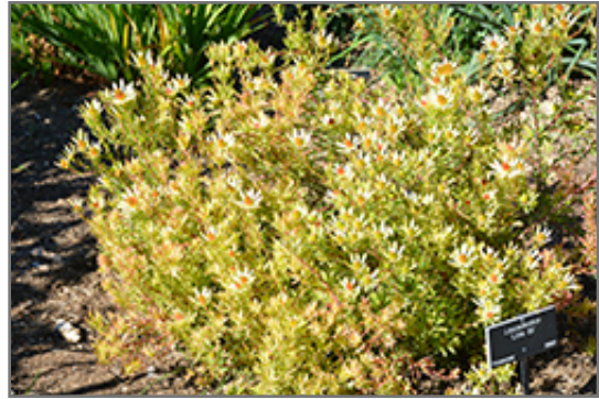
Little Bit Conebush

This plant is not reliably hardy in our region, and certain restrictions may apply; contact the store for more information.