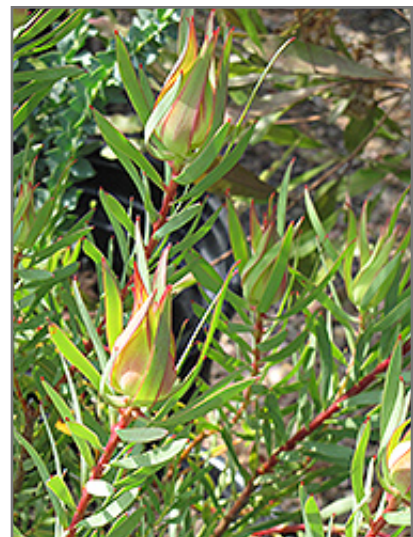
Little Bit Conebush