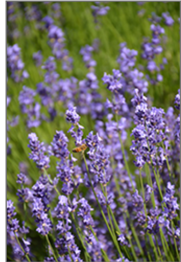
French Fields Lavender flowers