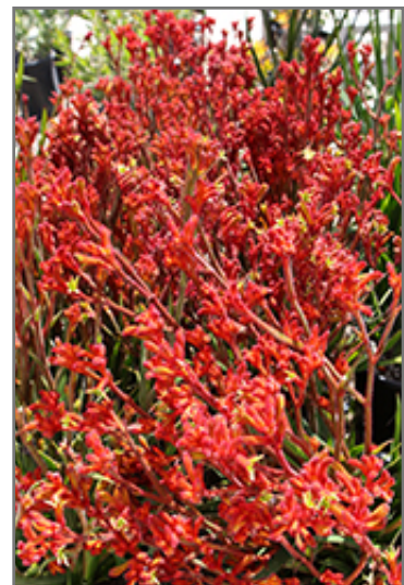
Bush Tango Kangaroo Paw flowers