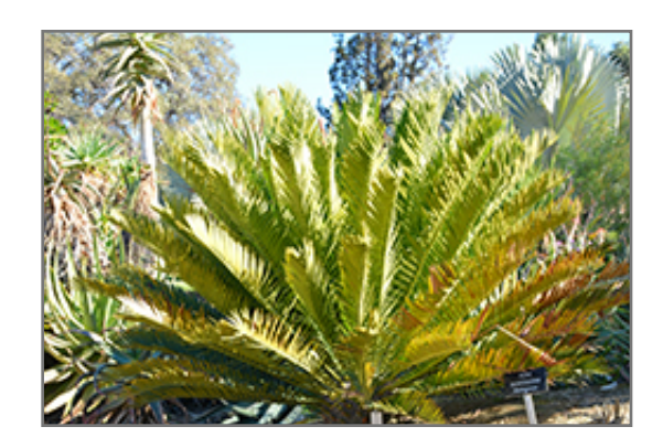
Lebombo Cycad