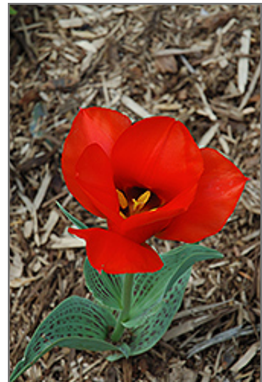
Casa Grande Tulip flowers